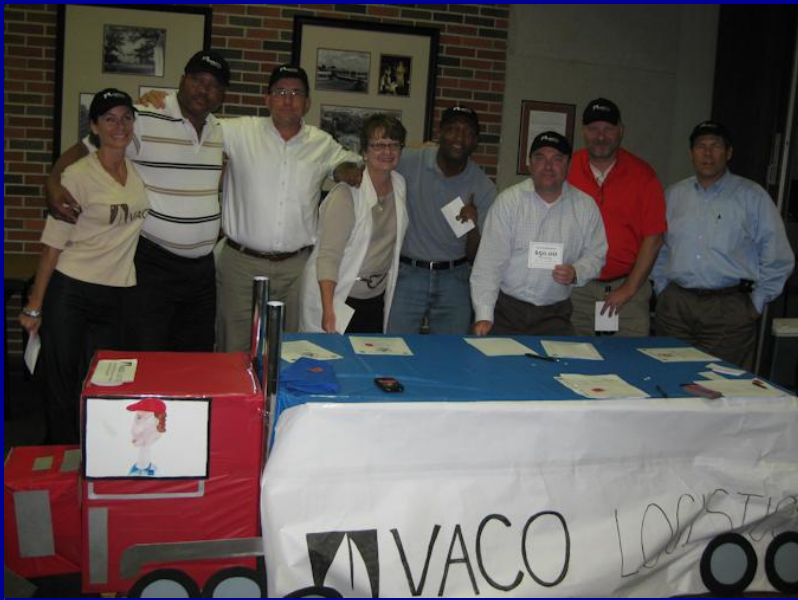
Table Decorating Contest Winner Vaco Logistics